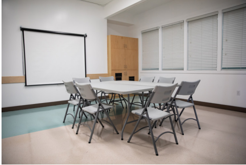
Pinecrest Room $15.60/hour

Connected to the Arena 1 black lobby, the Pinecrest Room can accommodate up to 18 people.