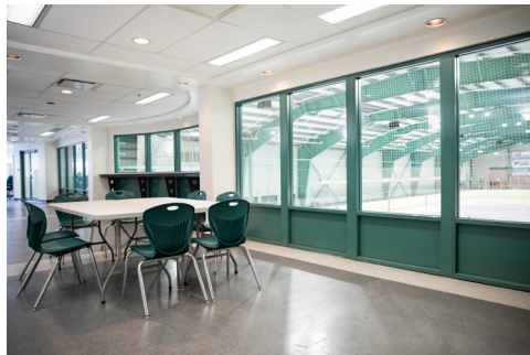
Dogwood Room $36.40/hour

Overlooking Arena 1, the VIP North Room can accommodate up to 10 people.