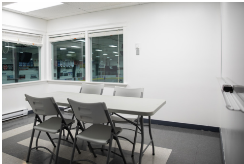
VIP North Room $15.60/hour

Connected to our main lobby and overlooking the pool, the Viewing Room can accommodate up to 25 people.