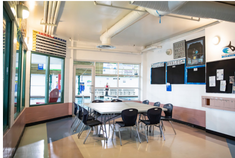
Pool Viewing Room $15.60/hour

Connected to the Arena 1 black lobby, the Pinecrest Room can accommodate up to 18 people.